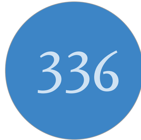
Flu Vaccine Doses