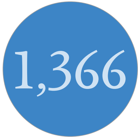
COVID Vaccine Doses

The school district and health department have held 20 school-based clinics with COVID and Flu vaccines this year.