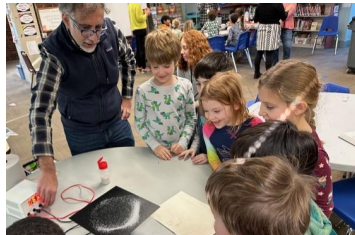
Brown's Family STEAM Night