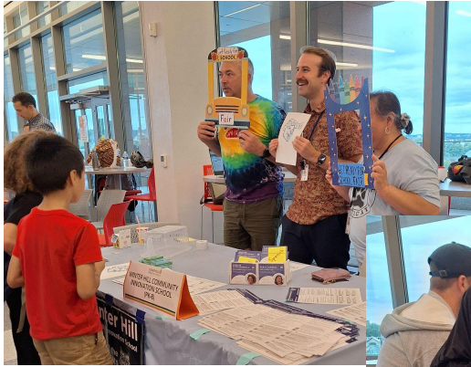
Staff at Winter Hill Community Innovation School (Top) and West Somerville Neighborhood School (Right) engage with students and families at the Get Ready for School Fair , August 2024