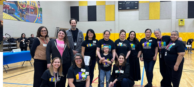
(Below) Liaisons, SFLC Staff, and SomerPromise at Summer Activities Fair, March 2025