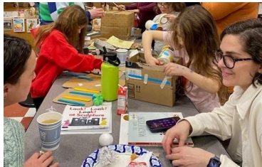
Kennedy's Family Literacy Night