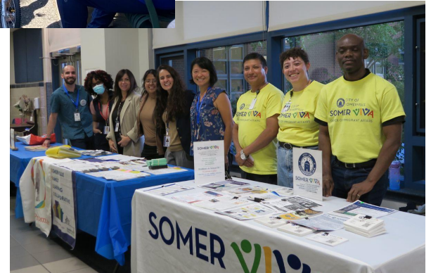
SFLC Interpreters, Liaisons, and Community Partners at Argenziano's Back-to-School Night