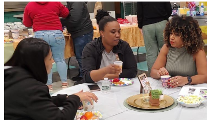
Healey's Bilingual Parent Support Group for Portuguese & Spanish speakers