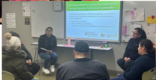
Spanish session (Above) of the Restorative Practices Workshop, December 2024